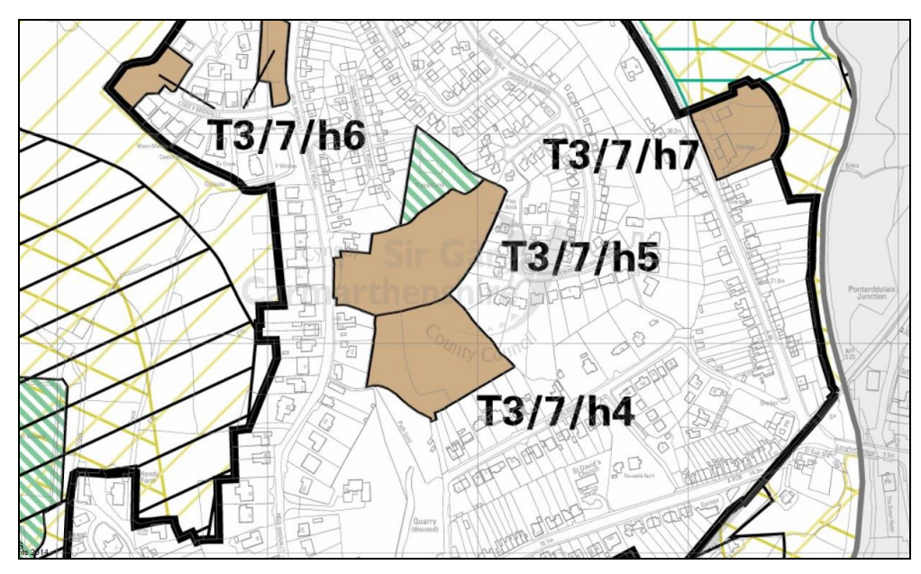
Plan B - 2014 Adopted LDP Proposals Map for central Hendy

3.3 The failure to submit detailed proposals to develop sites is quite striking in a settlement such as Hendy. The settlement lies immediately off Junction 48 of the M4 Motorway and benefits from excellent road and rail connections, particularly the A42138 distributor road to Llanelli. It benefits from a local primary school, range of convenience shops and supermarket at Pontardulais, community centre, rail station at Pontardulais and numerous public houses.