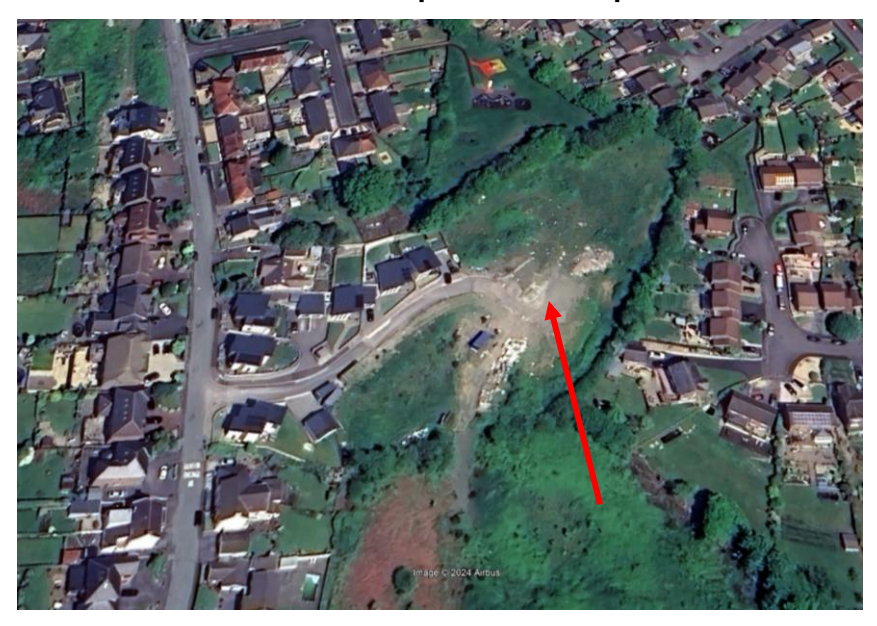
Photograph 1 – May 2023