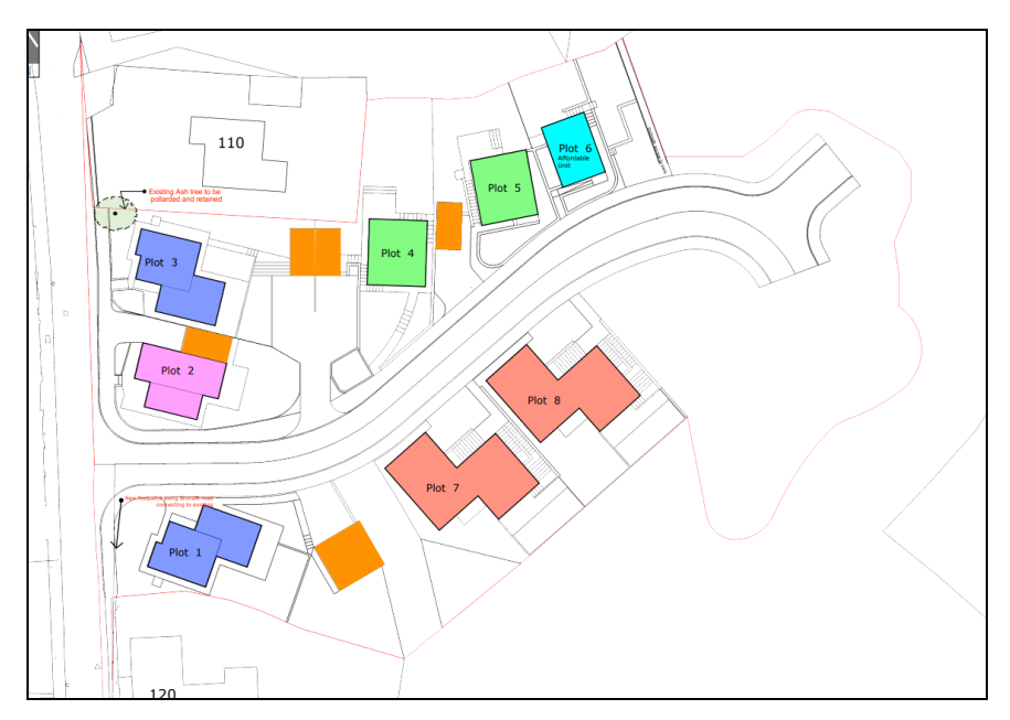
Plan B – 2018 approved site layout to western portion of Allocation

2.2.1 The proposed allocation has been subject to one full planning application granted in April 2017 under Application S/34537. It proposed a total of 8 houses over the western portion of the site only, as shown below at Plan B.