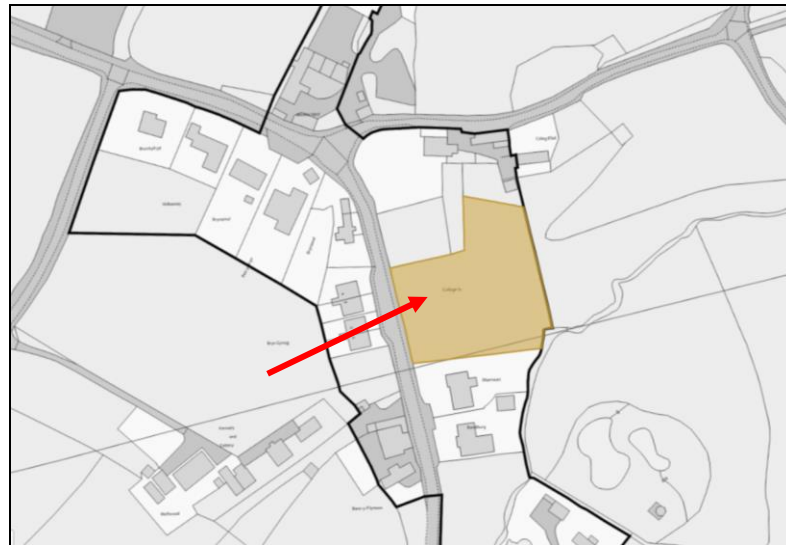
Plan A – Second Deposit Draft Map Extract

2.1.1 Since the submission of our original objection to the allocation of the land for housing development purposes, the proposed allocation (Plan A) remains undeveloped, as illustrated by the aerial photograph below.