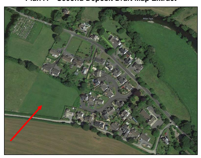
Photograph 1 - Google Earth - July 2021